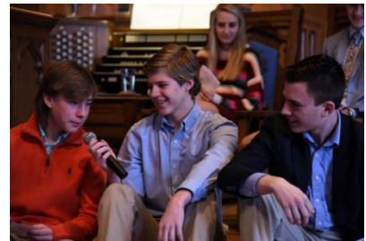
Pictured above: Youth leading Call to Worship Picture below: Youth leading Children's message