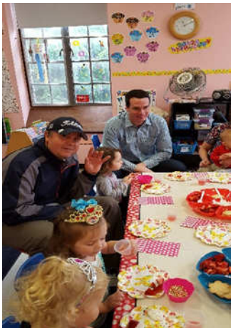
Tea Party with Dads