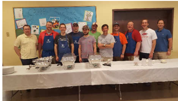
Helpers at Dad's Breakfast