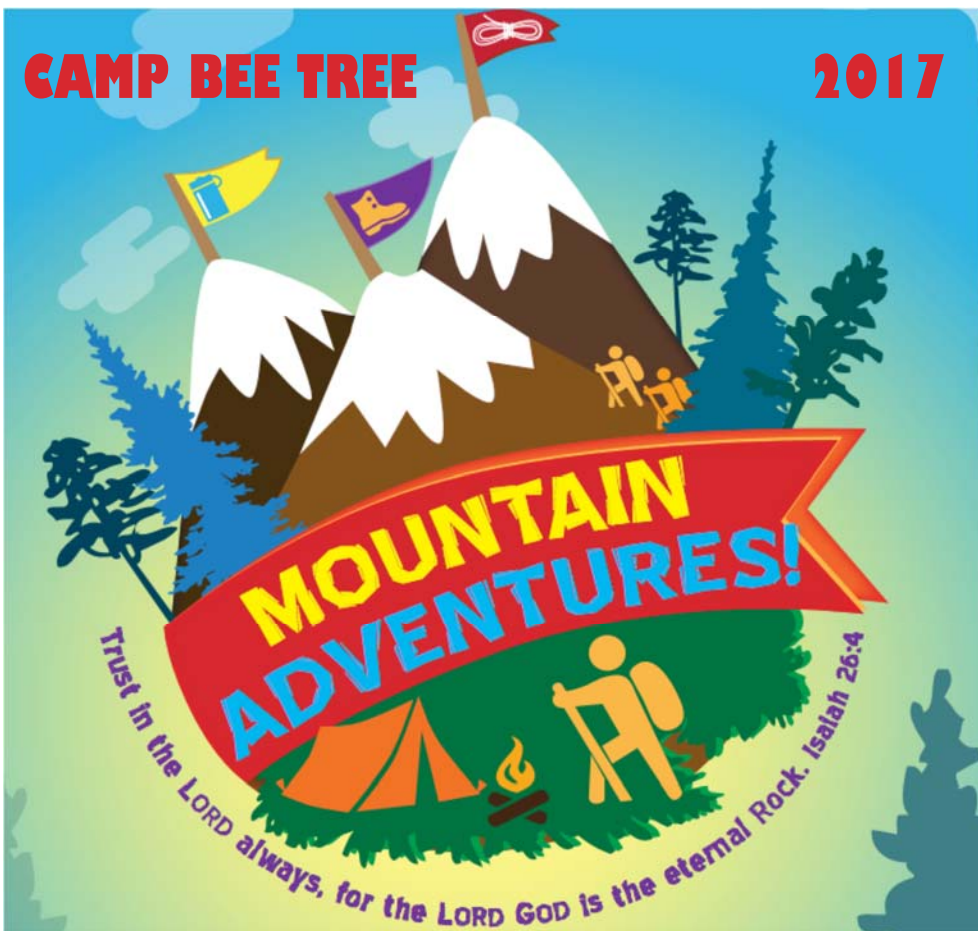
Our Christian day camp for children JULY 10-14, 2017